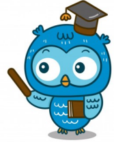
Northwest Continuing Education